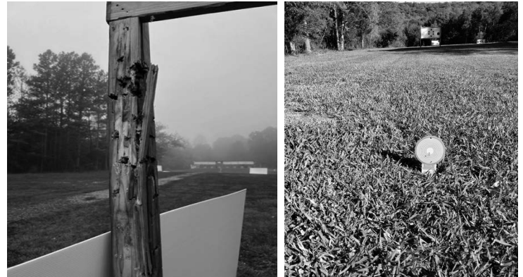
Figure 1: Target Frame Abuse at Benchrest Range. The Frame and Target Backer were less than 1 week old!