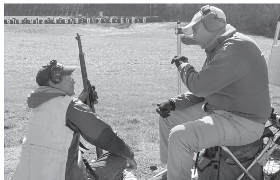
Learning how to shoot the M1.

clinic is to teach the fundamentals of rifle marksmanship that are a foundation of not only competitions, but of all recreational shooting or hunting.