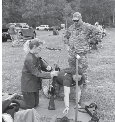
April 2021 Class photo at the completion of the clinic.