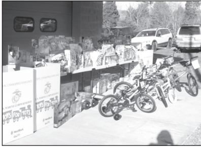
What it's all about.