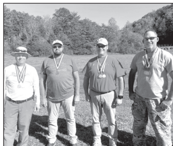
Medal winners for the Grand/Springfield/Vintage Military Matches.