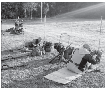
Frost and pleasant weather all weekend was a welcome relief from last year's heat.