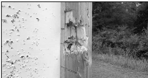
This is what happens when targets are placed in the NO FIRE ZONE. This 4 x 4 support post will need to be replaced soon by club volunteers.