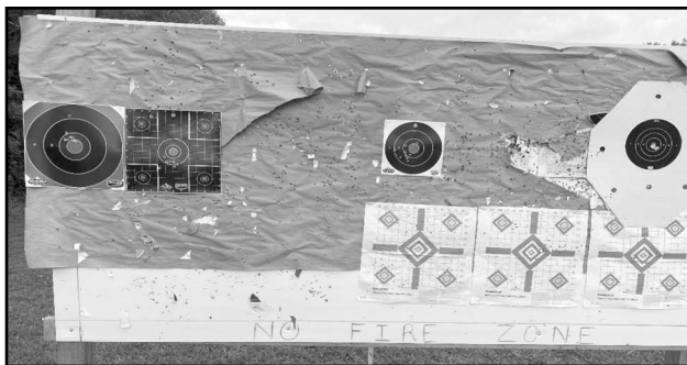
Please keep the brown paper and the targets OUT of the marked NO FIRE ZONE.