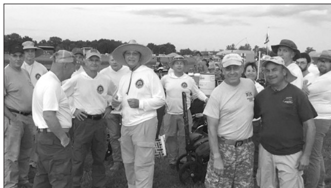
Hanging loose before the Team Match.