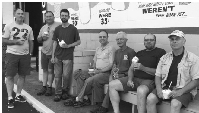
Nothing better than ice cream at Andy's in Port Clinton after a hot day on the Camp Perry Ranges.