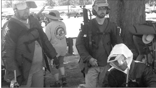
Wind Puppies girding for Rattle Battle.