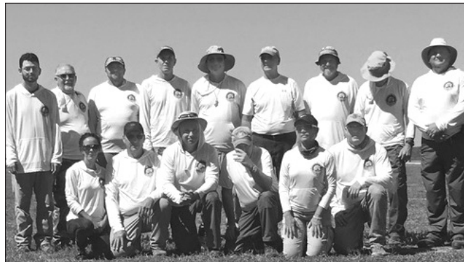
Our Rattle Battle Teams, Wind Dogs and Puppies.