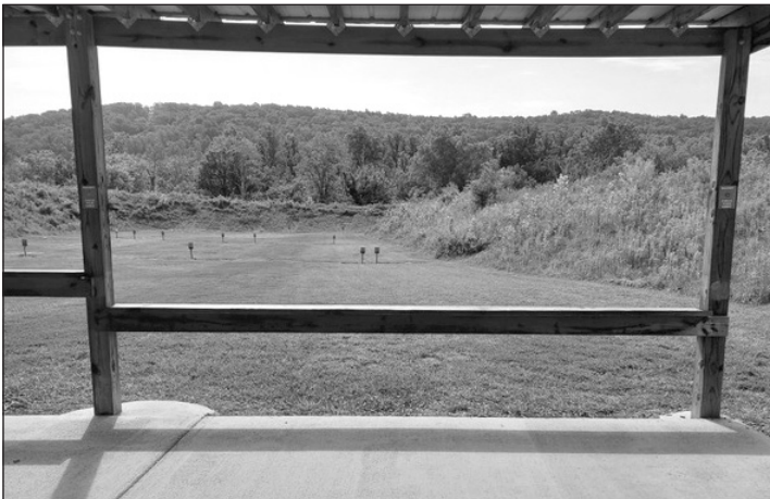
Lowered shooting bench at the Rifle Practice Range.