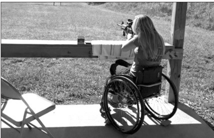
The new lowered bench being put to good use.