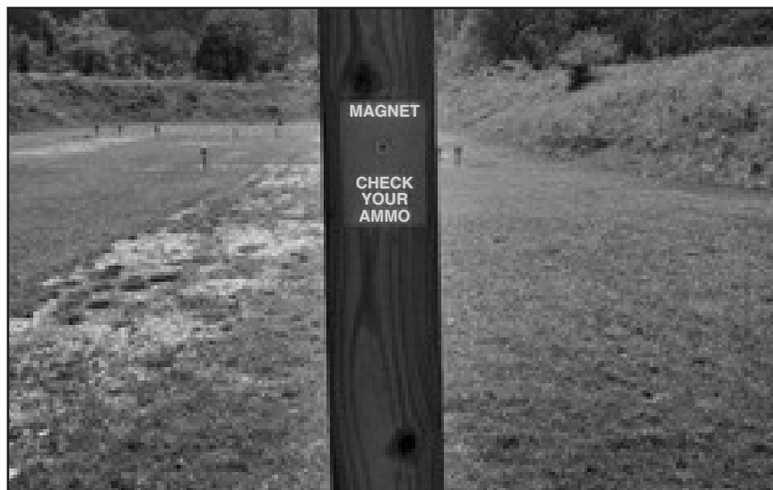
Check your ammo at the magnets located on the posts.